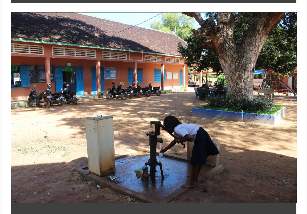
Children drink unfiltered well water - this has to end!